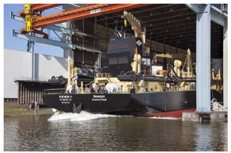
DCI DREDGE XXI floating out for the first time from the IHC Yard

The vessel will be deployed - along with the DCI DREDGE XIX and DCI DREDGE XX - for the maintenance-dredging project on the Hooghly River, which is a tributary of the Ganges River in West Bengal. These new DCI vessels are specially designed for this task, taking into account the Hooghly River's soil properties, strong current and shallow depth. The dredgers feature high levels of productivity, reliability and efficiency.