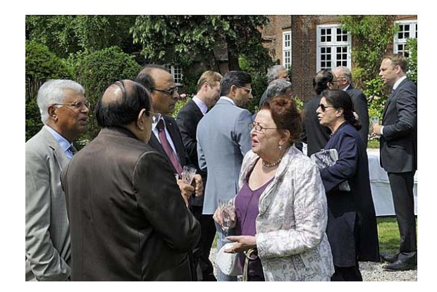
Vin d'honneur at India House following the presentation of credentials