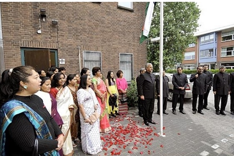
National Anthem being sung after the unfurling of the National Flag

The Embassy of India organized the Flag Hoisting ceremony at the Gandhi Centre (Cultural Centre) on the occasion of the 67th Independence Day of India. The President's Address to the nation on the eve of the Independence Day was read out by Ambassador Shri Rajesh Nandan Prasad. After singing of the National Anthem, a short cultural program was presented by the children of the Embassy officials. The function was attended by over 200 persons, including prominent members of Indian community, PIOs, Dutch and Surinami Hindustani community.